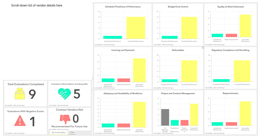
Vendor Performance Evaluation Dashboard

The new system incentivizes high-quality services and has created new expectations around performance monitoring and improvement. Contracts are no longer renewed by default, and to date the Town has decided not to renew three separate contracts based on data from the vendor evaluation system. In the long term, Town staff hope to contract with only the highest performing vendors in order to deliver Gilbert residents ‘best in class’ services and programs.